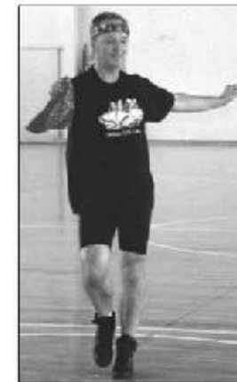
Internationally renowned choreographer and teacher

August 5-8, 2010 • Socorro, N.M. One hour south of Albuquerque