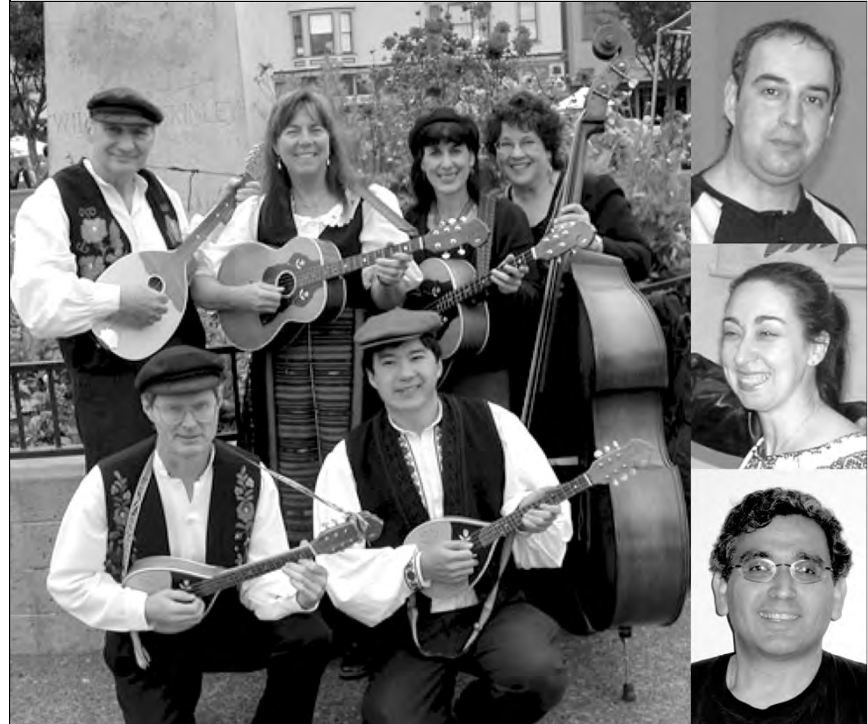
Published by the Folk Dance Federation of California, South Volume 42, No. 4 May 2006