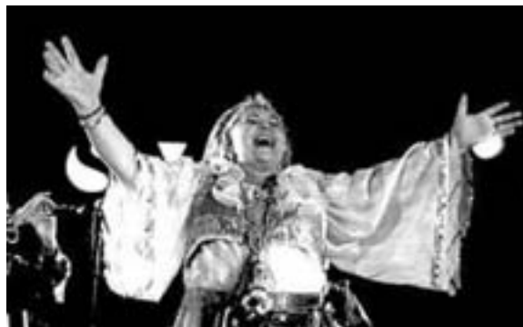
(This page is a paid advertisement.)

Handicrafts made by the women of Kosovo will be for sale. Proceeds all go directly to benefit the Kosovo refugees!