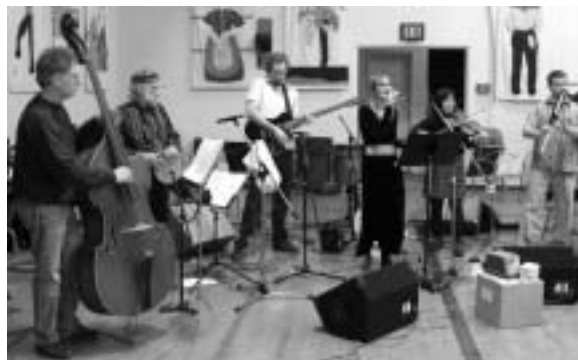
The Baksheesh Boys

Southwest International Folk Dance Institute invites you to the Land of Enchantment for our