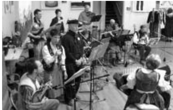
Madison Ave Folk