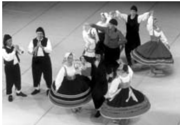
Couple Dances from the island of Krk (Lado)

If one looks closely - and listens, the spirits of conquerors and adventurers of two thousand years will speak to you from every view. The blue waters are dotted by hundreds of spectacularly beautiful islands which boast an average of 300 days of sunshine per year. This combination of warm sun and beautiful scenery is a tremendous attraction to thousands of tourists who flock there to toast bare bodies on hundreds of rocky beaches and more than a few lily white, northern European derrieres have suffered severe sun burn there.