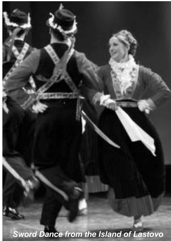
Sword Dance from the Island of Lastovo

The older layer of the dancing tradition includes the wheel dance and the dances performed in the past with certain ritual meaning at traditional annual events that were, among the Croats, directly connected to marking Catholic holidays, family events, particularly weddings and specific jobs, wherein dancing and mime had a specifically educational role. Folk dances also vary according to music accompaniment, namely, they can be without it, as the soundless wheel dances (gluvak, mutavo, šuplje kolo) with vocal accompaniment, as the so called šetano kolo, or they can be accompanied by vocals and instruments or only instruments. According to the number of dancers, the wheel dance can be solo, in twos, threes, or fours and can be open or closed.