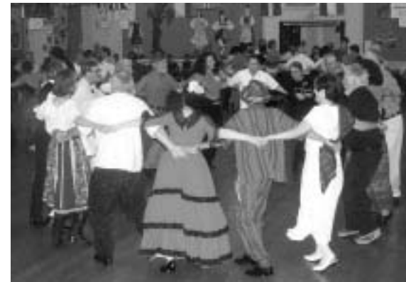
Dance Circle (note back wall decorations)