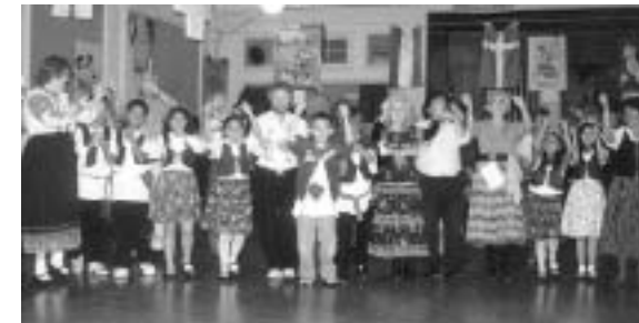
Children's performing group join the dancers

Special recognition is due to the Statewide Committee. The entire festival went smoothly, as though these folks had done it before, and indeed most of them had.