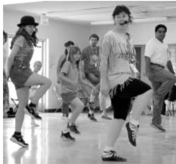
Irish Step Dancing

of set dances (Irish step, set and ceili), English country, Quebecois and Scandinavian dancing. All the dances were taught or walked through, and had fabulous live music played by many very talented musicians.