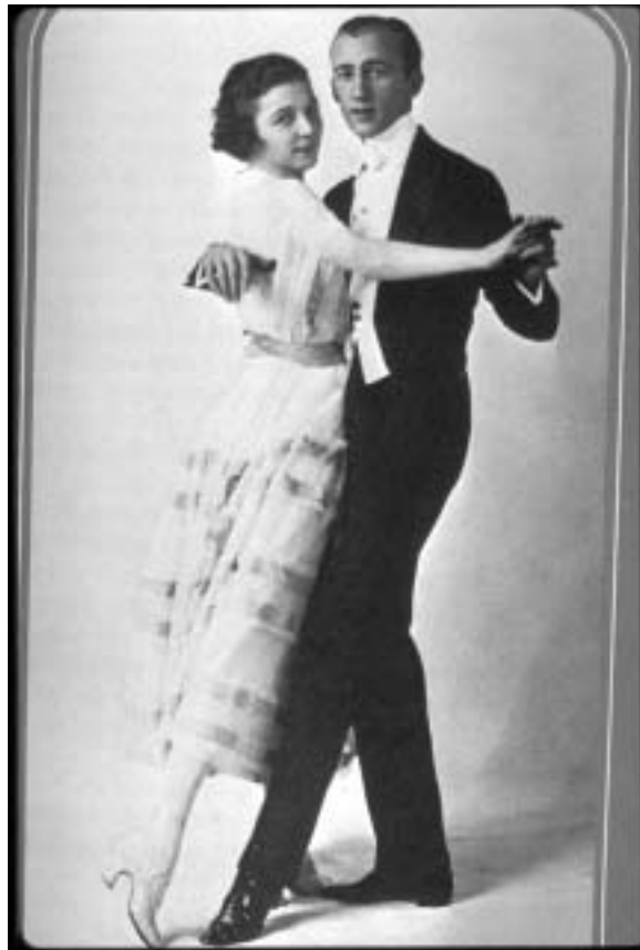
Vernon and Irene Castle