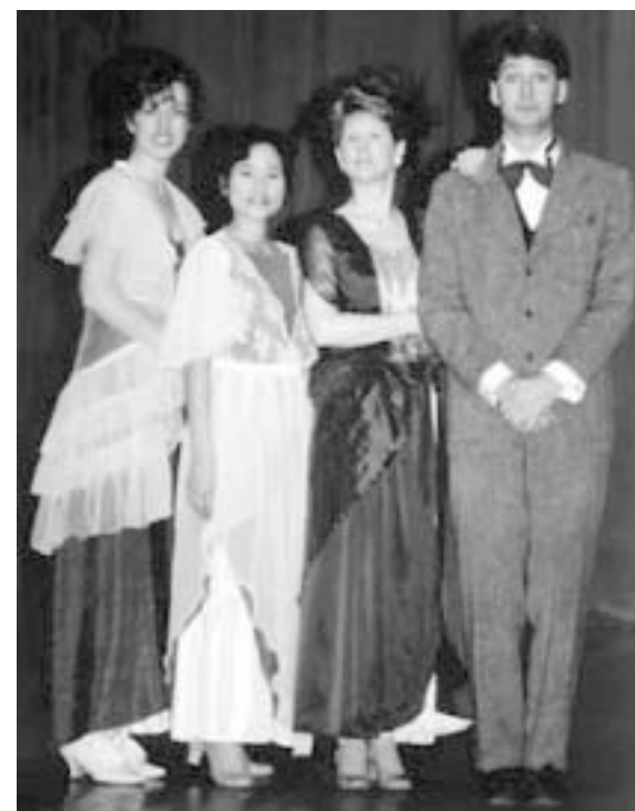
Stanford Vintage Dance Ensemble

Vernon immediately introduced the dance movement of backing the lady - something that could not be done in a floor-length skirt - and women have danced backward ever since.