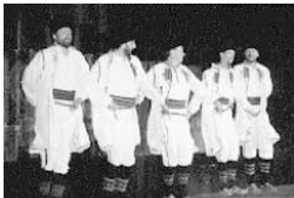
The Kolo Dancing Ensemble of Norway

When the music starts at the average wedding, or any other festive occasion, it will be for the "kolo. In any one area the repertoire will consist of 4-5 dances such as U Sest, Zikino, Cacak, sometimes Setnja, and variations on Lesnoto and Cocek. The latter two, of course, are not from Sumadija (Central Serbia), but have become popular. These may vary from region to region, but the "kolo" is done almost everywhere.