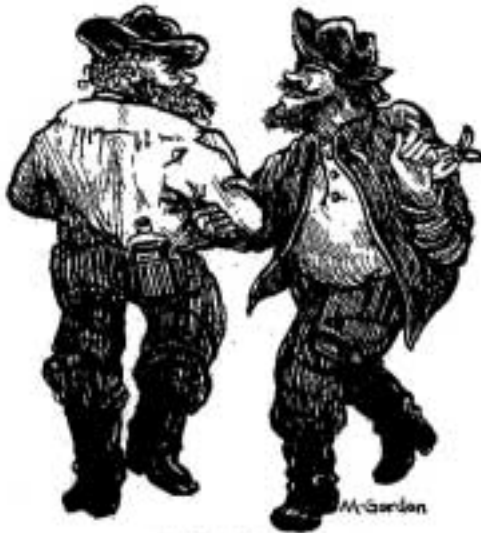
California Miner's Dance.

Save this date for fun and frolic in the historic California Gold Country!