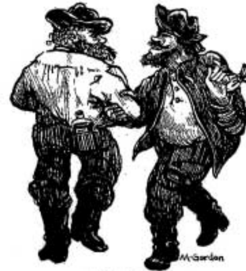
A. California Miner's Dance.

Save this date for fun and frolic in the historic California Gold Country!