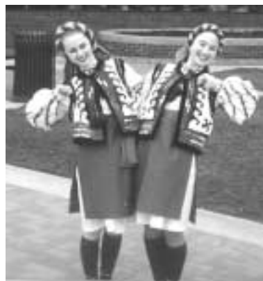
Barvinok Ukrainian Dance Ensemble of Calgary

It is difficult to find words to describe it adequately. How about: A lovely, holistic, creative group experience of joy and beauty. Holistic, since it engages not just the body but our whole being; creative, since it is actively performed not passively observed; a group experience, not something I do but something WE do,