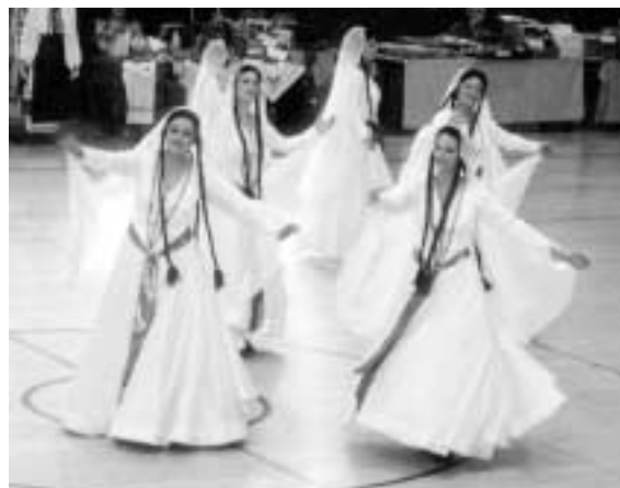
Georgian Dance at Laguna Festival

Dunaj started in 1977, with a phone call from a teacher at a middle school in Newport Beach. She wanted some dancers to perform folk dances for their upcoming "International Day". The list of countries I suggested stunned her: Hungary, Ukraine, Bulgaria, Poland, Germany.