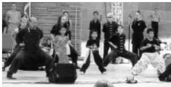
Chinese dancers at Outdoor Ethnic Day

A beautiful wooden floor and good air conditioning make the Charleston Heights Art Center a great place to dance; and, of course, the dance sessions are always the core of a Statewide Festival. We appreciated the fact that the spacious room could accommodate a children's corner, where our four- and six-year old grandchildren could play with several other visiting children when they got tired of the grown-up music and dance.