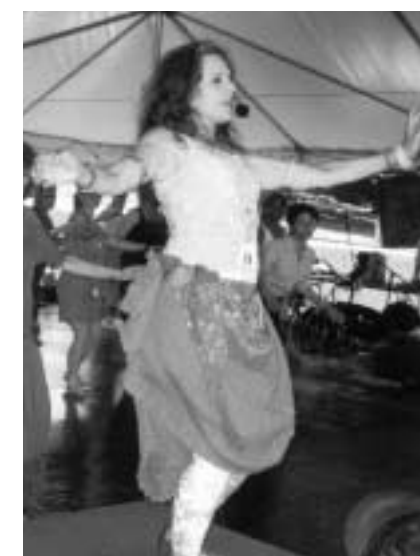
Mesmera (belly dance)