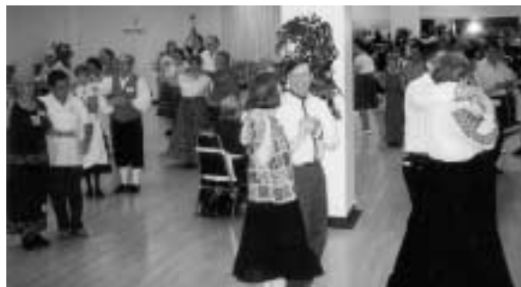
Dancing at the Charleston Heights Art Center