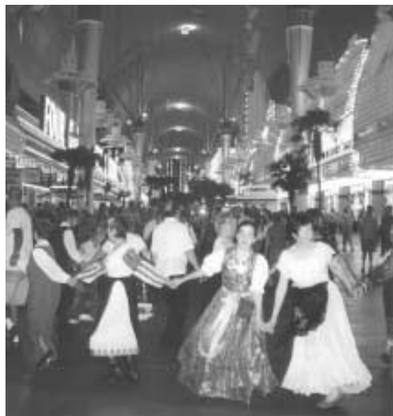
Dancing at the Fremont Street Experience