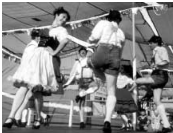
Bavarian Dance at Oktoberfest

For the past two years we've been performing our Early California Fandango (see cover photo), with authentic dance material from Al Pill and Lucille Czarnowsky among other sources. We joined forces