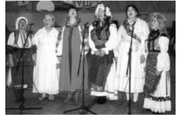
Zhena Folk Chorus sings at the Concert