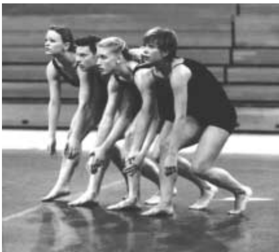
The Paul Taylor Dance Company presenting a workshop/demonstration at the 1998 Dance Day

On Sunday 29th April, 2001, as every year since 1982, Dance Day will be celebrated all over the world. The CID has prepared the following guidelines as a useful checklist for dance directors. This general term is meant to include all people institutionally involved in the wider field of dance: teachers, choreographers, group leaders, journalists, researchers, associations, suppliers, organizations etc.