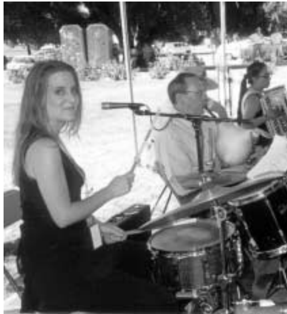
UCLA Balkan Music Ensemble