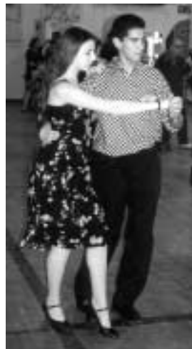
Young Waltz Partners

Finally, Grup Dansaire Catalonia ended the program with traditional dances, including a whimsical dance done in wooden shoes. As an introduction to the Sunday afternoon dance, with music by Madison Ave. Folk, the Catalonian group invited everyone in the audience to join them for their national dance, a dance of unity and friendship, Sardana.