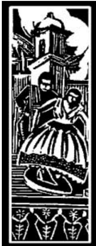
1946 Statewide Festival Logo showing the Ojai Post Office

The Ojai Festival has one of the longest traditions in Southern California folk dance. This event occurs