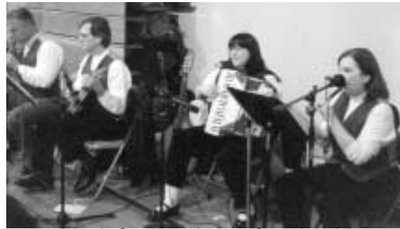
Atlantic Crossing plays on Saturday night

Atlantic Crossing brought us live music for a portion Saturday evening, carrying on their long standing tradition. Their singers impressed us with their beautiful voices.