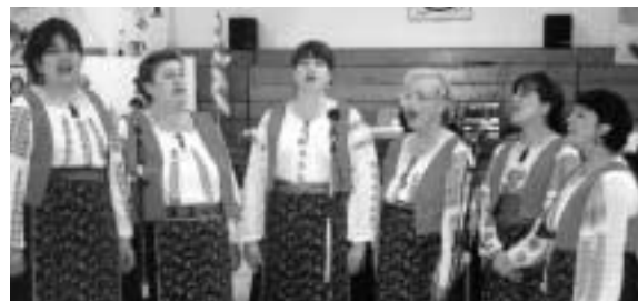
Zhena Folk Chorus performs at the Sunday concert

Sunday's concert was filled with talent. It began with the unique and amazing sounds of Zhena Folk Chorus.