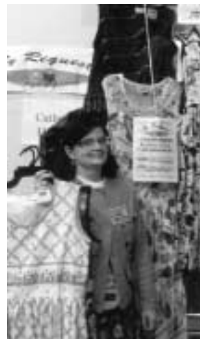
New Dance Dresses