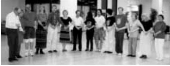
Ethnic Express International Folkdancers